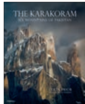
THE KARAKORAM | 2021 | ISBN 978-1-85894-687-0